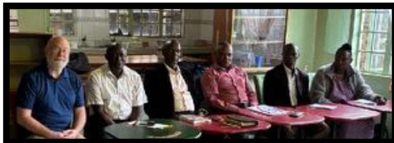
Sitting with all but one student who was sick on the last day.

What an amazing congregation! I really want to pause and express my heartfelt thanks to all of you. My recent trip to Kenya has been an extremely stressful trip. And I thank you for your faithful prayers.