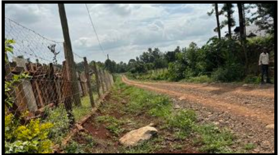
Outside of our "home" in the country

Second, the Kenyans all participated well and made my teaching more effective. I was concerned with material fitting into their context. I am pleased to say that only one concept had some "lost in translation" issues. Finally, instead of our normal stay in the Maina Hotel in Embu, we stayed in a Vrbo house located in the country near Kagio (about 35 miles south west of Embu). This location provided a peaceful respite outside of the normal city "busyness". This country living provided a beautiful back drop to relax, refresh and prepare for the next day.